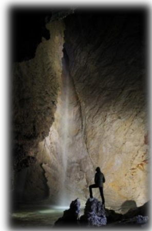
Grotta di Rio Martino

Rooms: 2 to 12 people. The house provides sheets and blankets. Bring towels.